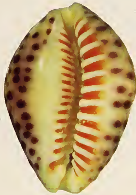
Figure 1 a